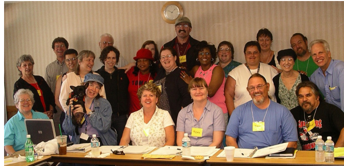
Finding Our Voices Training

To promote employment of persons who have received mental health services in a range and variety of careers of their choices, including the public mental health system.